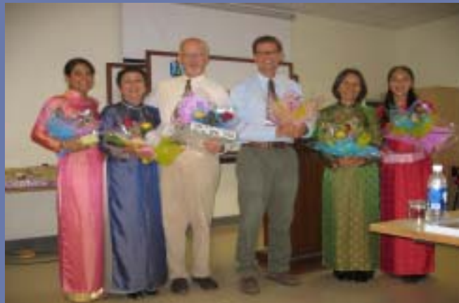
CHEER's 2004 teaching team