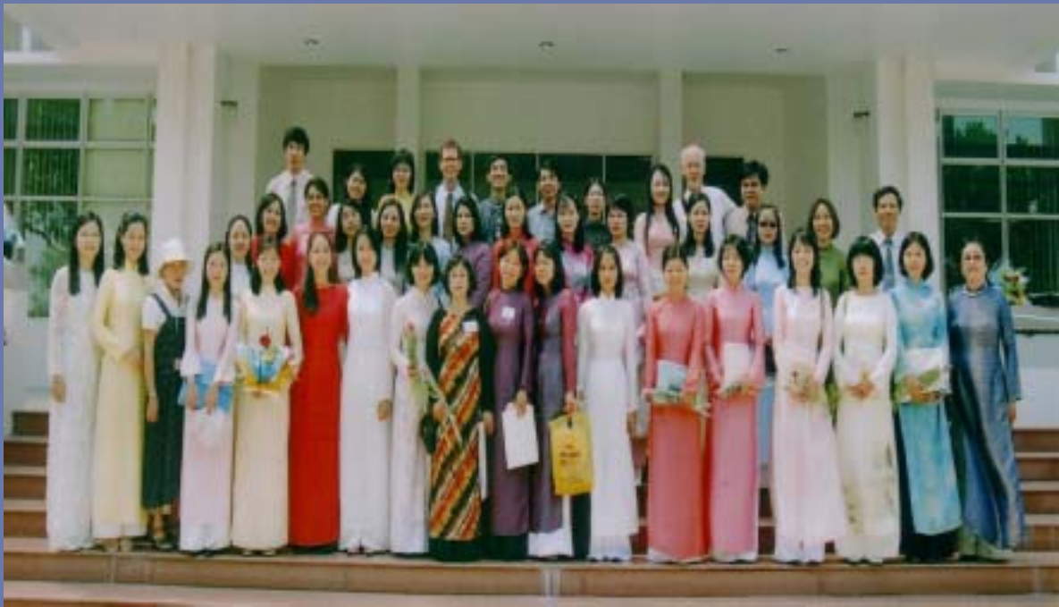
Teacher participants from Hue University and Hue high schools