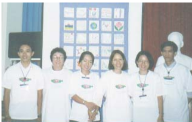
Teachers from Ho Chi Minh City Industrial College IV