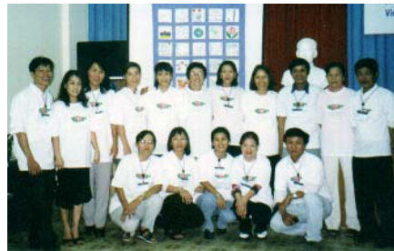
Teachers from Nha Trang Preparatory College for Ethnic Students