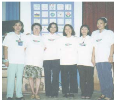
Teachers from Navy Academy