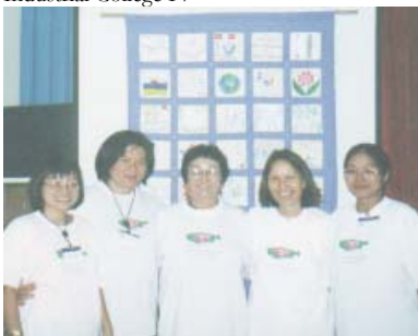
Teachers from Center for Foreign Languages, Vung Tau