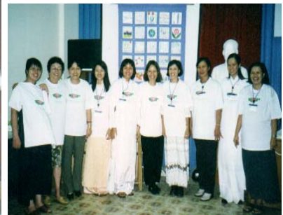
Teachers from Nha Trang University of Fishery